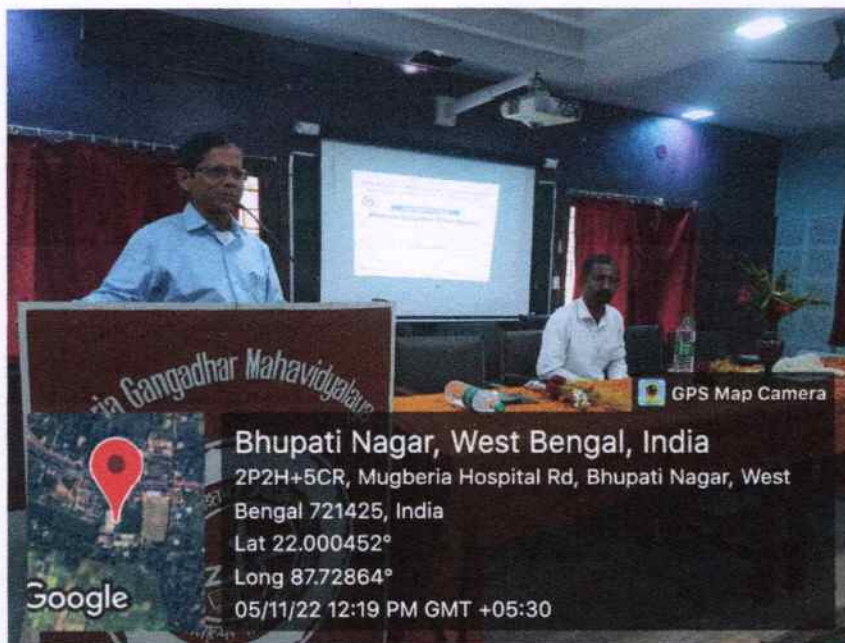
Inaugural Speech of Principal Sir