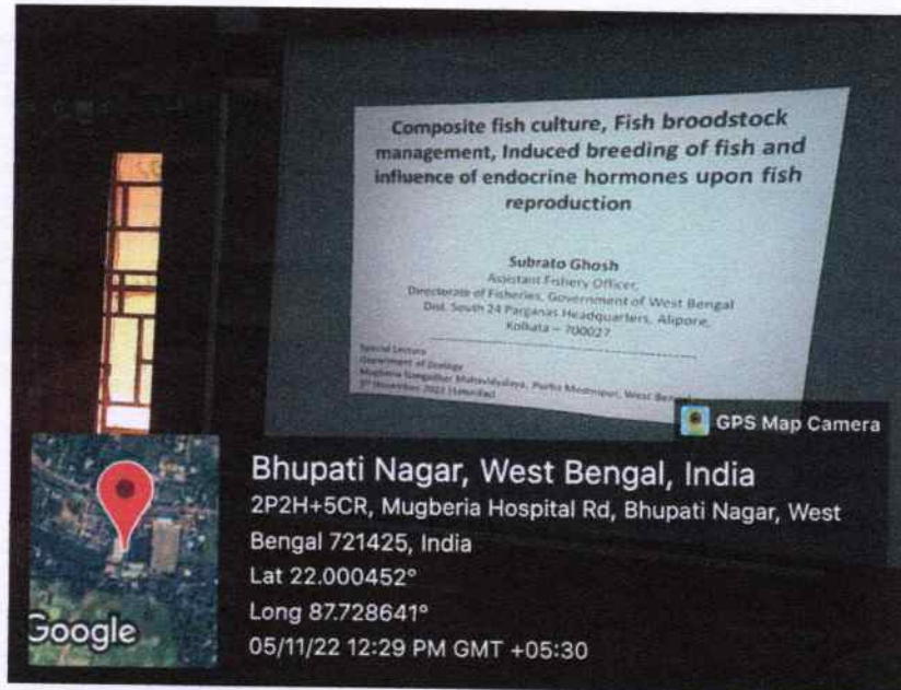
Presented slide of speaker