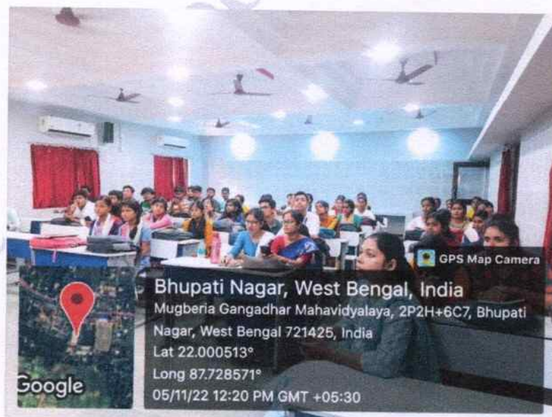
Teacher and students were present that day